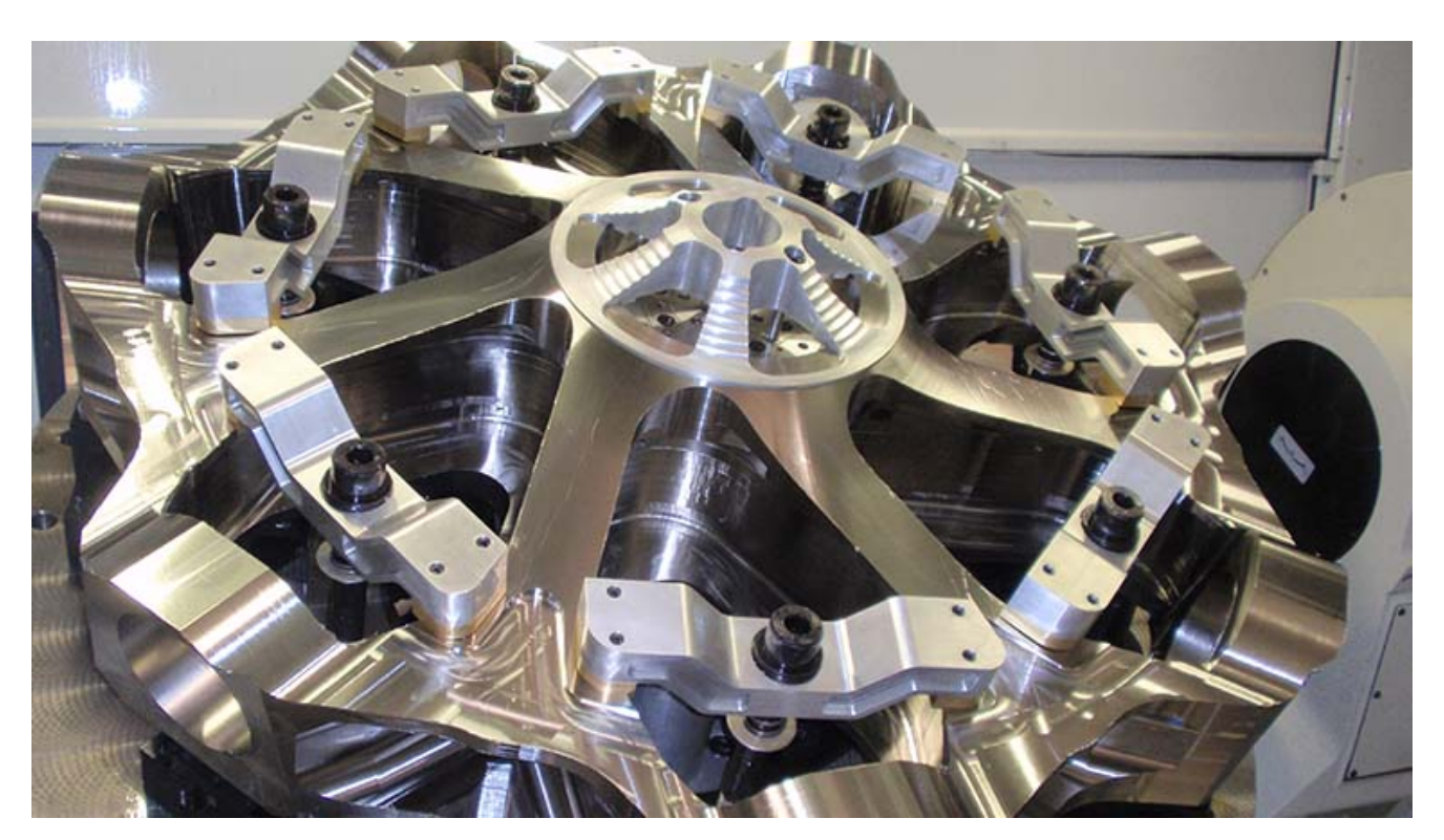
Prismatic workpieces such as this helicopter rotor hub are typical work for Mitsui Seiki's large five-axis machining centers.

What makes PH stainless steel alloys relatively tough to machine, Francis explained, is "the high-strength material matrix and an average UTS (ultimate tensile strength) of 200 ksi/1,379 Mpa. If there is forging scale to cut though, the challenge is greater. The scale is very abrasive and can cause depth-of-cut notching. Depending on part shape and complexity, it is sometimes possible to use a high feed or copy mill (round inserts) to remove the scale prior to heavy machining."